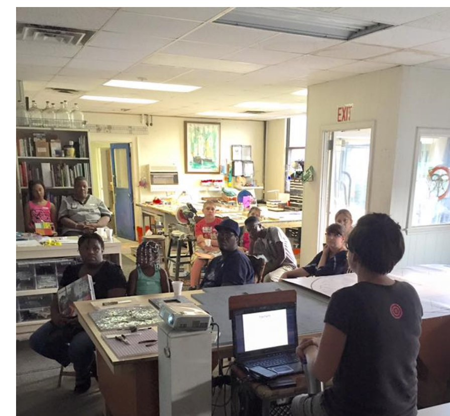
Jump Start Students visited McElf GlassWorks in Fall 2016 to learn about mosaics and architectural glass work.